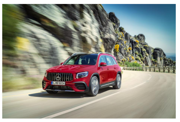
Mercedes-AMG's GLB 35 4MATIC